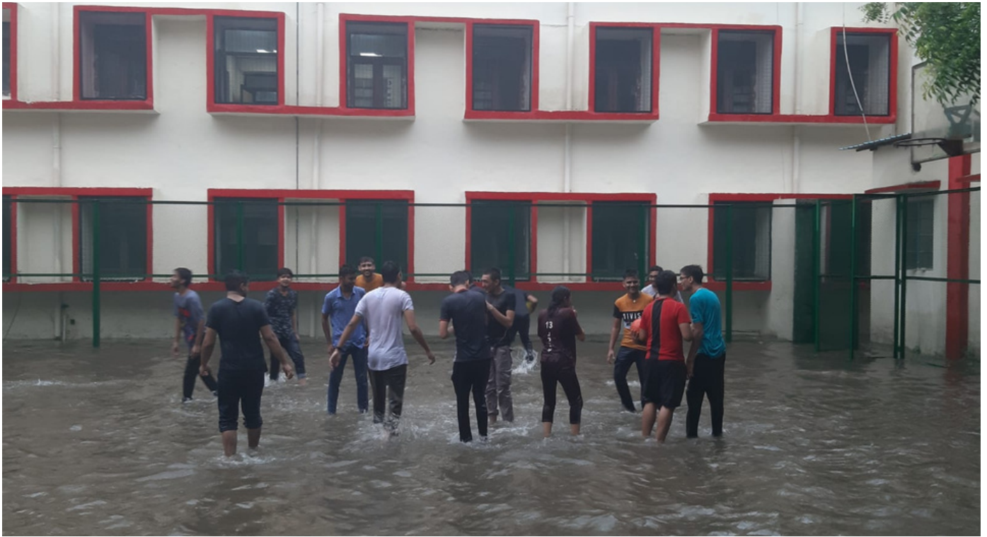
Little moments, Big Memories